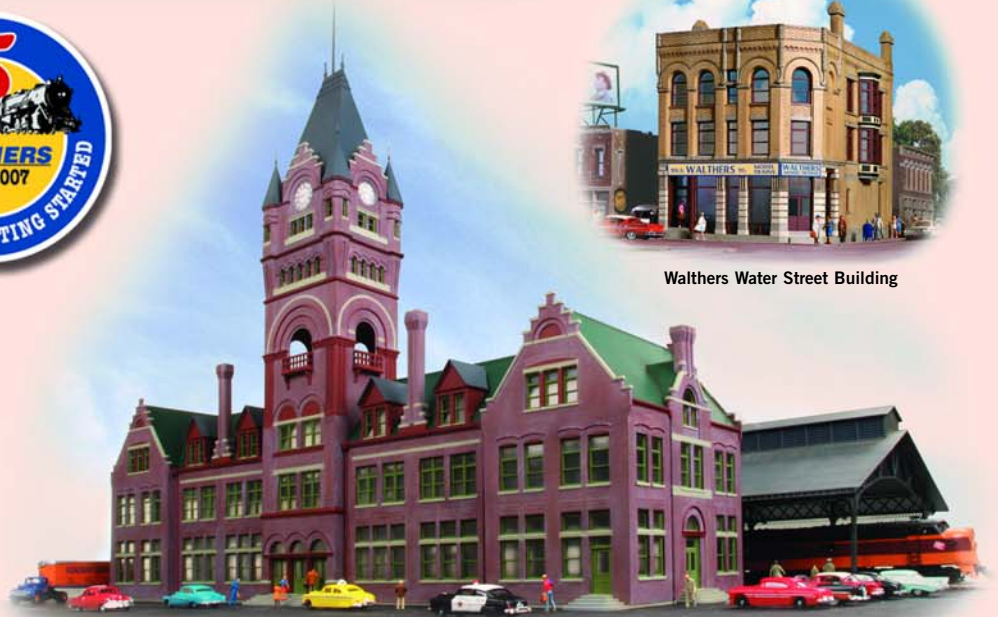
Limited-Run Milwaukee-Style Station & Train Shed