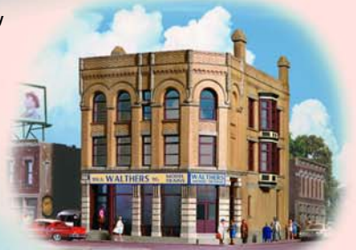
Walthers Water Street Building